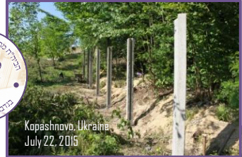
Kopashново, Ukraine July 22, 2015

Trees surrounding Bais Hachaim are cleared away to allow for boundary erection.