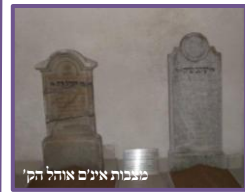
מצבות איים אוהל הק