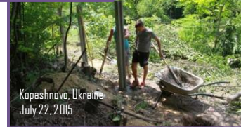
Kopashново, Ukraine July 22, 2015