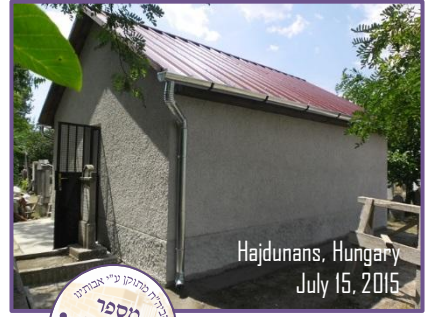
Hajdunans, Hungary July 15, 2015